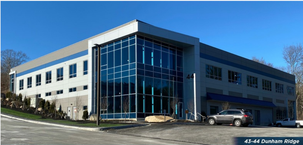
43-44 Dunham Ridge