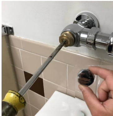
2.) Turn the screw to either side until the water flow stops