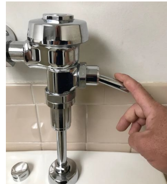
3) Flush to confirm the water flow has returned to normal