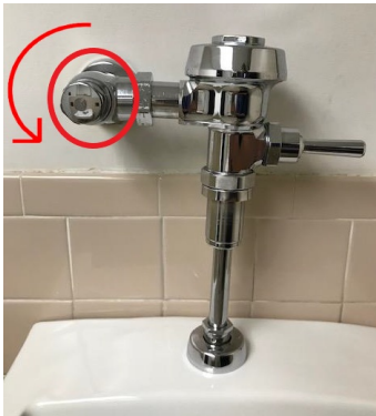
1.) Twist to remove the outer cover

Please help us conserve water by addressing leaking toilet and urinal fixtures on sight. A service call may be placed by phone (781-935-8000), online , or through the app-like shortcut for smartphones . Alternatively, clients may follow the three steps outlined below to quickly resolve a leak or continuous flush.